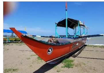
The infamous boat out of water

The Philippines is an island nation with a tropical climate, forested Mountains, lowlands with fields, flowers, fruits, great food and unbelievable traffic. The Filipinos are incredibly hard working but often still poor, yet they are always friendly, helpful and smiling. Many of the men do not live at home; they work as seafarers for international container ships and come home once a year for a month or so. Many other Filipino men and women work internationally as nurses.