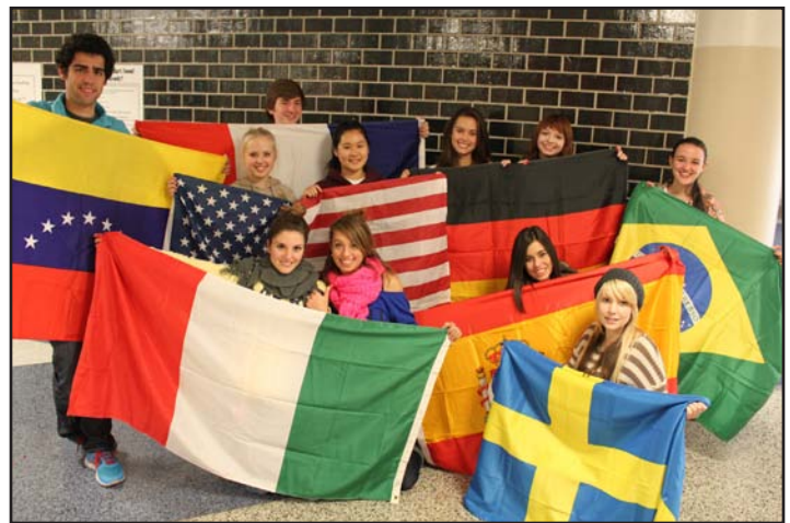
Apparently it was Flag Day at Armstrong High School. Pictured are some of this year's international students. Countries represented include Italy, Sweden, Norway, Venezuela, Spain, Germany, France, China and Brazil.

Please rsvp to Don Wolter at donwolter@hotmail.com or 763-545-0007 by April 7.